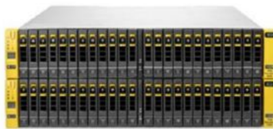
HPE 3PAR StoreServ 8000 Storage (4-Node Storage Base)