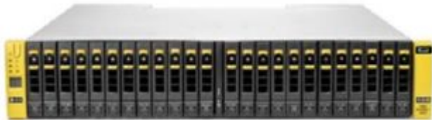
HPE 3PAR StoreServ 8000 Storage (2-Node Storage Base)

HPE 3PAR StoreServ 8000 is storage made effortless.