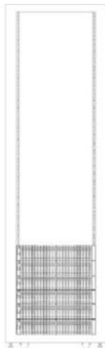
StoreServ 8000 (4-node Storage system in a non-storage centric configuration in a HPE Intelligent Series Rack)